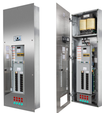
Isolated Power Panel

Line isolation monitors oversee the isolated power system and display the total system hazard current, while offering: