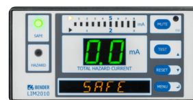
Line Isolation Monitor (LIM2010)