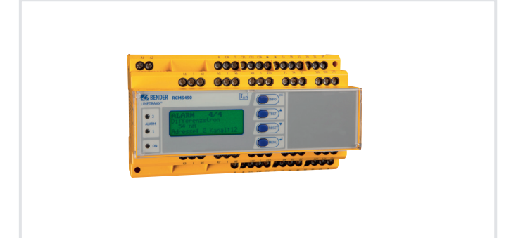
RCMS490 series ground fault monitor - MG-T.2